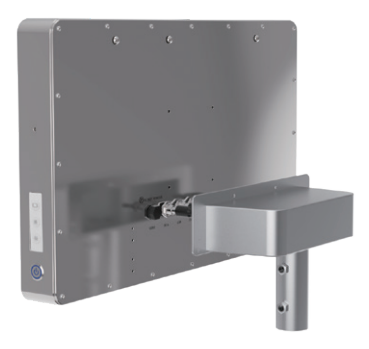
882B815A0A0E GOT821A C1D2-Cover kit (down)