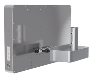
882B815A1A0E GOT821A_C1D2-Cover kit (up)